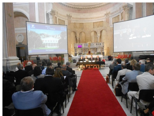
Conference “Artistic and Monumental Heritage – Restoration, Safeguard and Enhancement” at Basilica di San Giovanni Maggiore a Pignatelli