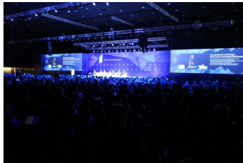
European Economic Congress

missioner Juncker's plan involve both research projects and construction projects with the participation of civil engineers (with varying levels of responsibility). This will surely offer an opportunity to gain new experience, skills, the challenge lying in the shared responsibility for the modernization of the economic infrastructure. It is civil engineers who will be responsible