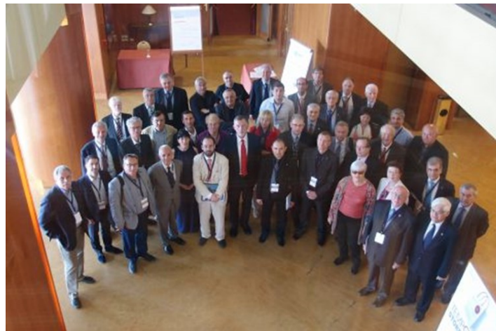
Group photo of the 62 nd ECCE General Meeting participants

The 61 st ECCE General Meeting – 30 th ECCE Anniversary has finished successfully. It was held on 29 th – 30 th May 2015, in Naples, Italy hosted by the National Council of Italian Engineers (CNI).