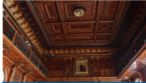
Detail of the ceiling in ASEA Headquarters