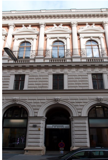
Façade of the ASEA Headquarters