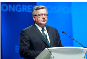
Bronisław Komorowski President of Poland

The European Economic Congress (20-22 April 2015) is an annual debate between politicians and businesspeople from Poland and Europe, called by some “the Polish Davos Forum”. It is the most important annual economic event of that type in Central Europe.