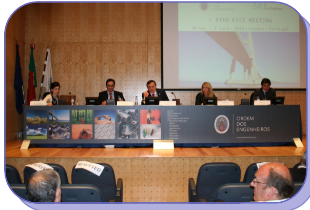
Conference "Changes in Civil Engineering"

In this situation, many of the construction companies, without work in Europe, had only one way to survive: to internationalize, meaning to move to the countries where public investments exist, namely in South America, Africa and Far-East. With them went the engineers, the architects, and in general all the members of the construction cluster. Several European construction companies