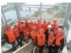
Visiting Latvian National library