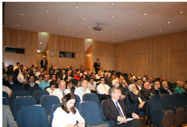
57th ECCE General Meeting and ECCE/OE Conference “Changes in Civil Engineering” audience

During the 57 th ECCE General Meeting a special meeting was organized between the ECCE Executive Board, the President of the Ordem dos Engenheiros and the Japan Society of Civil Engineers that participated for the first time in one of the ECCE Meeting. During this meeting many important issues were discussed regarding the enhancement of the cooperation between the organizations for the benefit of the civil engineering profession. Also, an Agreement of Cooperation between the Japan Society of Civil Engineers and the European Council of Civil Engineers was mutually signed.