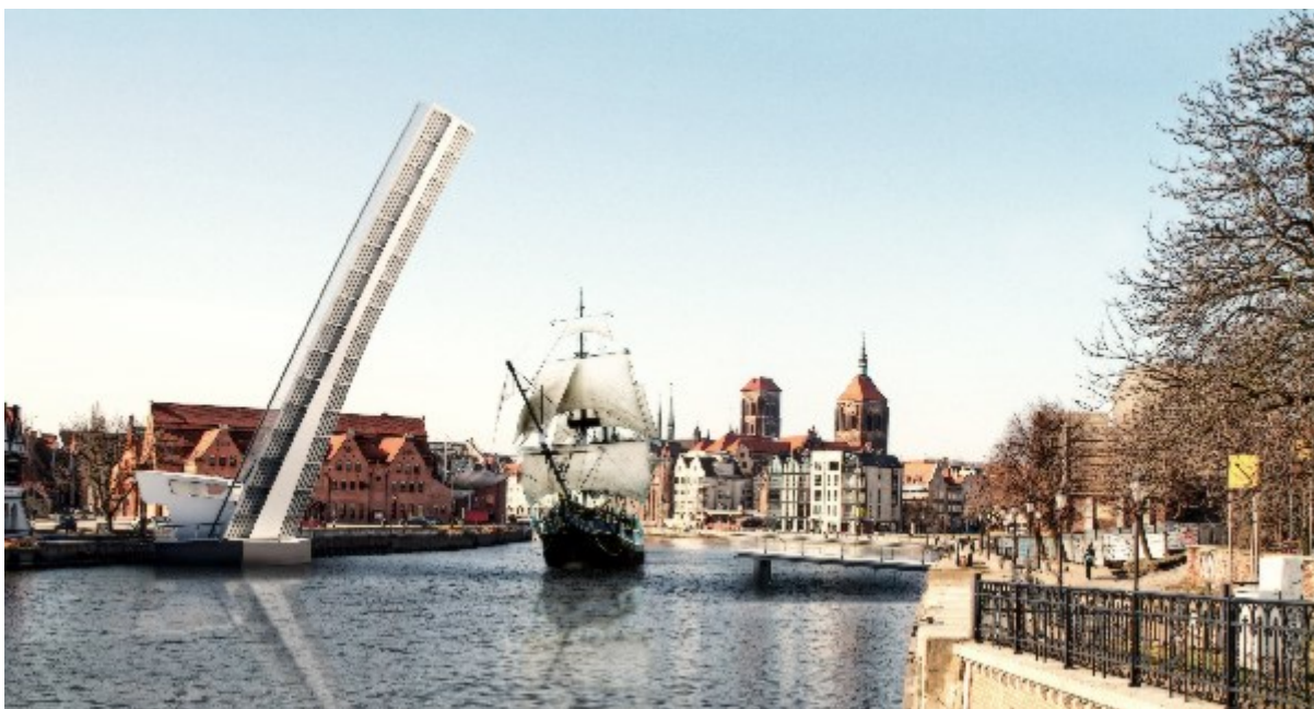
Future Drawbridge over River Motława in Gdansk Poland, 1. award in the International Design Competition, designed by Ponting d.o.o., Maribor, Slovenia