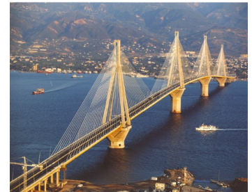
Rio - Antirrio Suspended Bridge, Greece